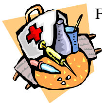
First Aid Scavenger Hunt