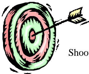
Shooting Sports Safety