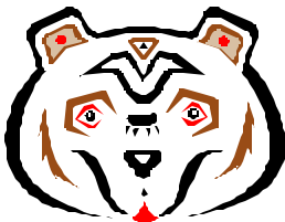
Indian Carvings & Leather branding