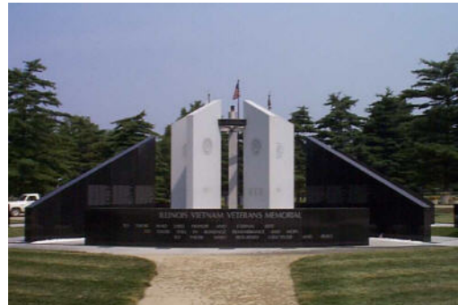
Vietnam Veterans Memorial