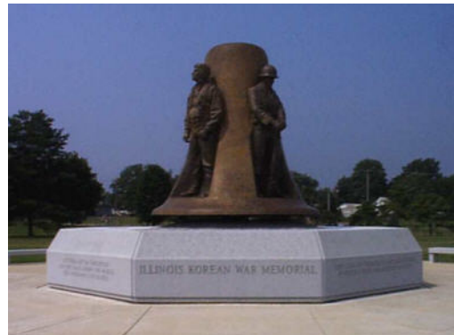
Korean War Memorial