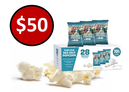
28pk Sea Salt