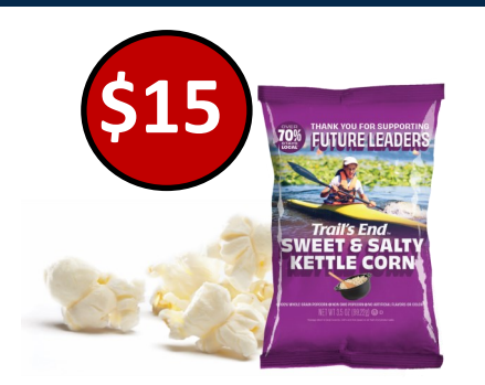
Sweet & Salty Kettle Corn