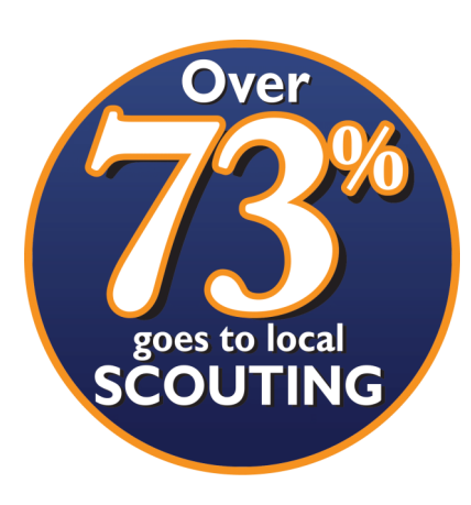
$1 - Heroes & Helpers Donation