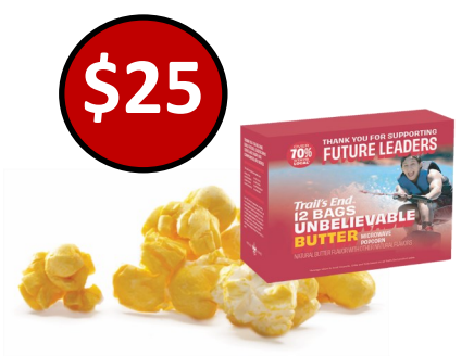
12pk Unbelievable Butter Microwave